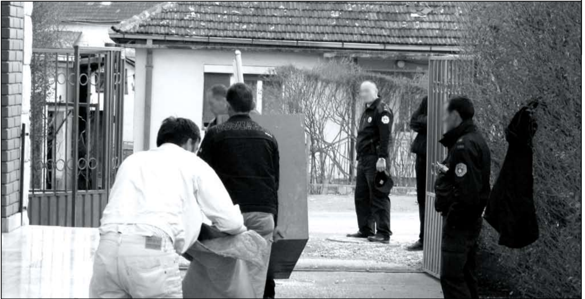
By police assistance, KPA evicted illegally occupant from one house in Pejë/Peć